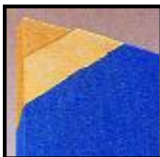
HIGH IMPACT Absorptive in high traffic areas.