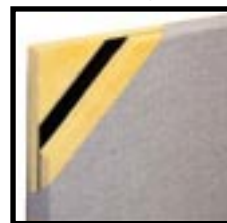
NOISE BARRIER Barricade vinyl barrier, ideal for areas requiring high STC.