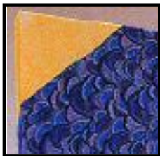
ABSORPTIVE High performance absorption.

INSTALLATION: Adhesive, hook & loop fasteners, mechanical clips, impaling clips, magnetic clips, splines.