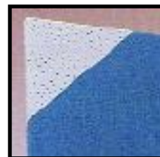
MINERAL CORE multi-purpose panel for absorption and sound blocking.