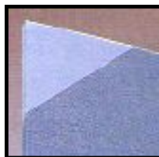
TACKABILITY 2 Tackability where sound absorption is not necessary.