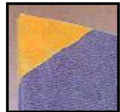
ABUSE RESISTANT For gymnasiums, absorption and abuse resistance.