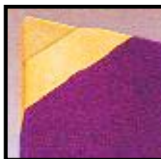
HI-TACK High absorption and tackability.