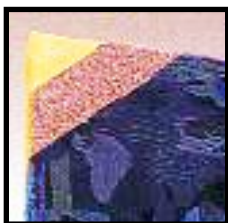
TACKABLE 1 For long lasting and effective tackability.